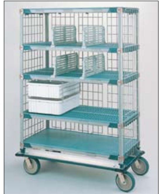
Shown with Optional Dolly Base. See Spec Sheet 9.05 for MetroMax Accessories.