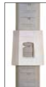
Wedge Connector Included with each shelf or shelf frame. Bag of 4. Cat. No. 9985X