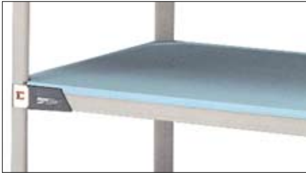
Solid Shelf Mat with Microban ® Product Protection