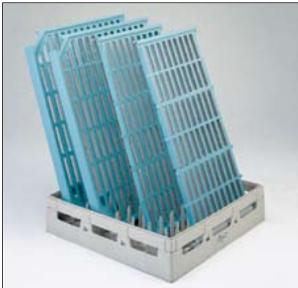
Open-grid shelf mat sections fit into the dishwasher for easy, thorough cleaning.