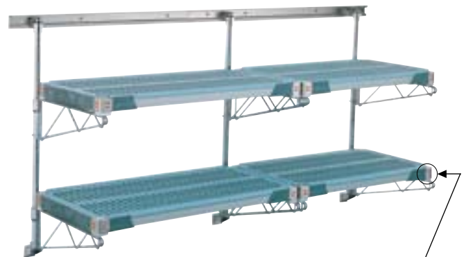
MetroMax shelves can be used as part of the SmartWall Plus ™ System (Spec Sheet #10.41)