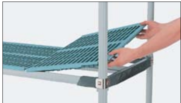
Solid and open-grid shelf mats remove and interchange quickly.