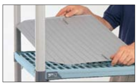
Open-grid shelf mats remove quickly for cleaning.