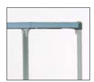
Shelf fits tightly over wedge connector.