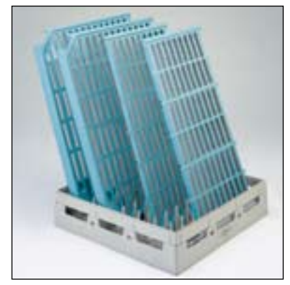
Shelf mat sections fit in the dishwasher for easy, thorough cleaning.