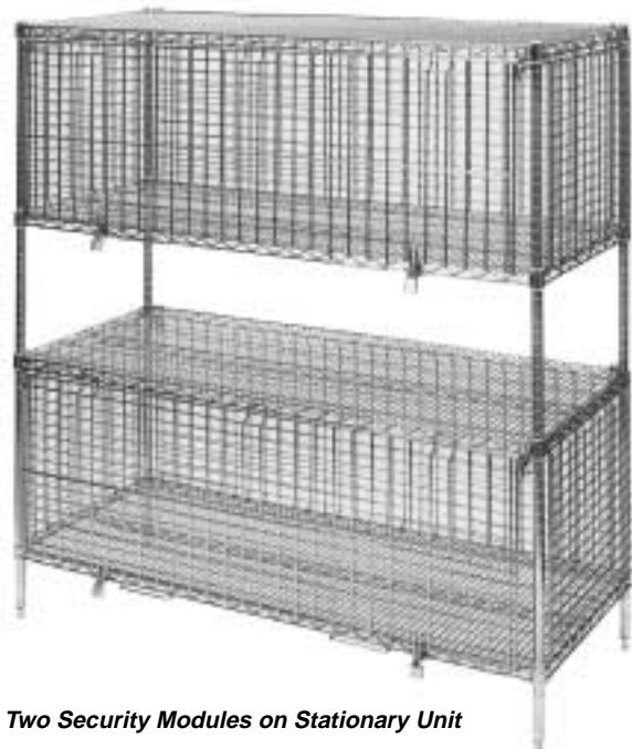
Two Security Modules on Stationary Unit