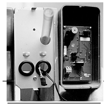
Figure 3: Front view of fascia