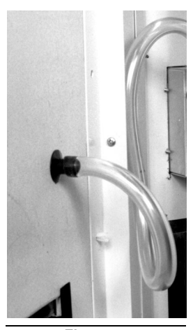
Figure 4: Back view of fascia