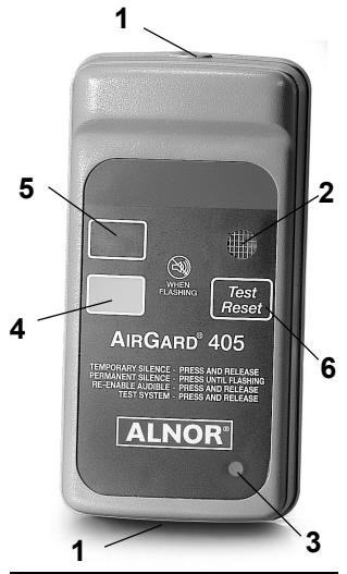
Figure 1: Front view of instrument