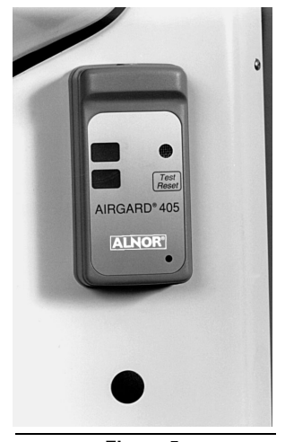
Figure 5: Typical installation

Calibration of this instrument should only be performed by qualified personnel. Proper guidelines for monitoring any ventilation apparatus are established on the basis of toxicity or hazards of the materials used, or the operation conducted within the ventilation apparatus. Personnel calibrating the AirGard 405 monitor must be completely aware of the regulations and guidelines specific to their application.