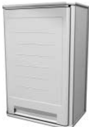
Single-Wide Overhead Cabinet with Solid Door

10 per package. 1" (25mm) H. x 16" (406mm) L. Cat. No. SXLABKIT