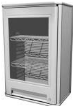
Single-Wide Overhead Cabinet with Wire Shelves (2) and Locking, Clear Door