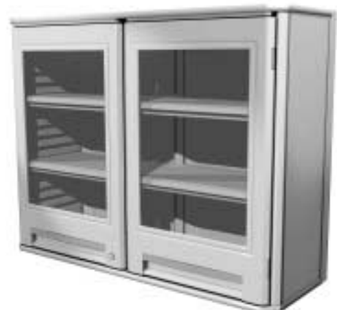
Double-Wide Overhead Cabinet with Polymer Shelves and Locking, Clear Door