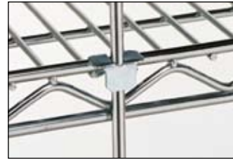
Rod with Tab in place