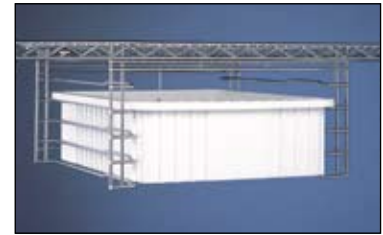
Super Erecta Slide System in place on shelf (Tote box sold separately)