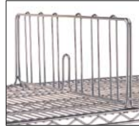
Shelf Divider for Super Erecta Shelves