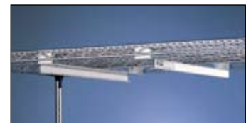
Adjustable Undershelf Slide

*Not adaptable to 24" (610mm) long shelf.