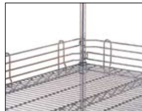
4" (102mm) Ledge

Note: Actual length is approximately 1" (25mm) shorter than nominal shelf length/width.