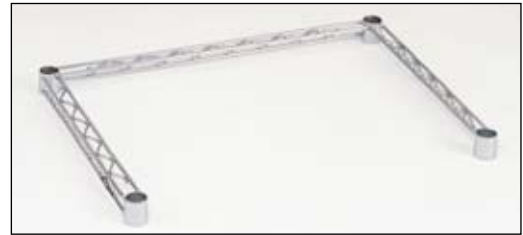
Three-sided Double Snake Frame