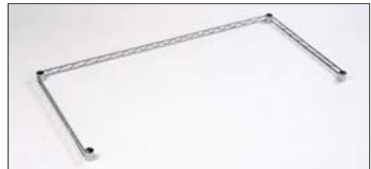
Three-sided Snake Frame

All Metro Catalog Sheets are available on our Web Site: www.metro.com